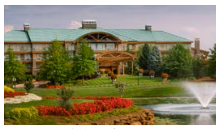
Turning Stone Business Center Verona, NY

We had two successful regional client conferences in 2018. These events allowed us to meet individually with clients in those areas and review their portfolios and discuss all of their positions.